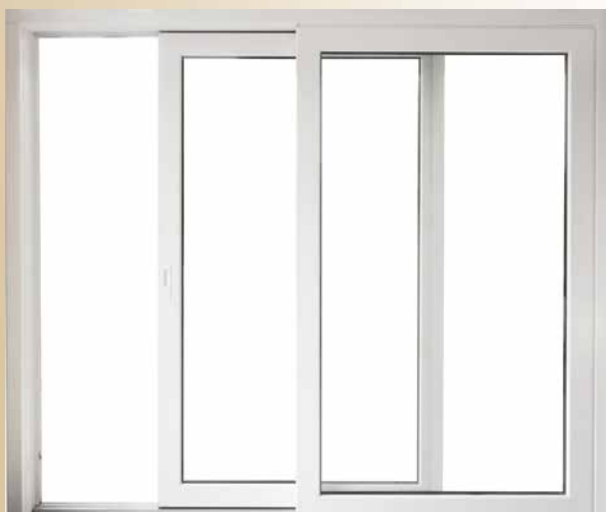
Sliding UPVC Window